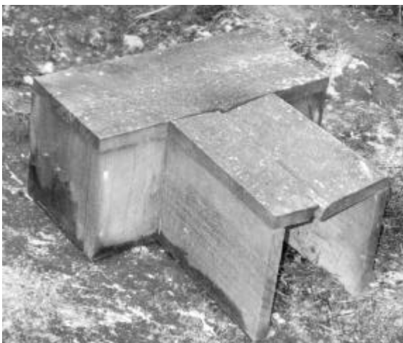
Figure 1. T shaped nest box

The design used for the first nest boxes was obtained by Kennedy during a private visit to Phillip Island Penguin Reserve in Victoria, Australia during the early 1980's and it was of the "T" shaped design illustrated in figure 1.